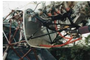
Continental O-300-D bottom & frame