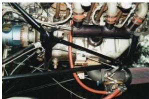
Continental O-300-D lower side