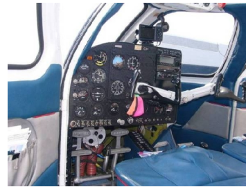
Republic RC-3 Seabee instrument panel

Powerplant: Franklin 6A8-215-B8F or 6A8-215-B9F 6-cylinder horizontally opposed engine, 215 hp at 2,500 rpm