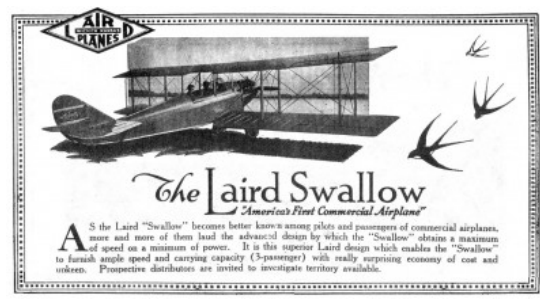
Advertisement for the Laird Swallow.